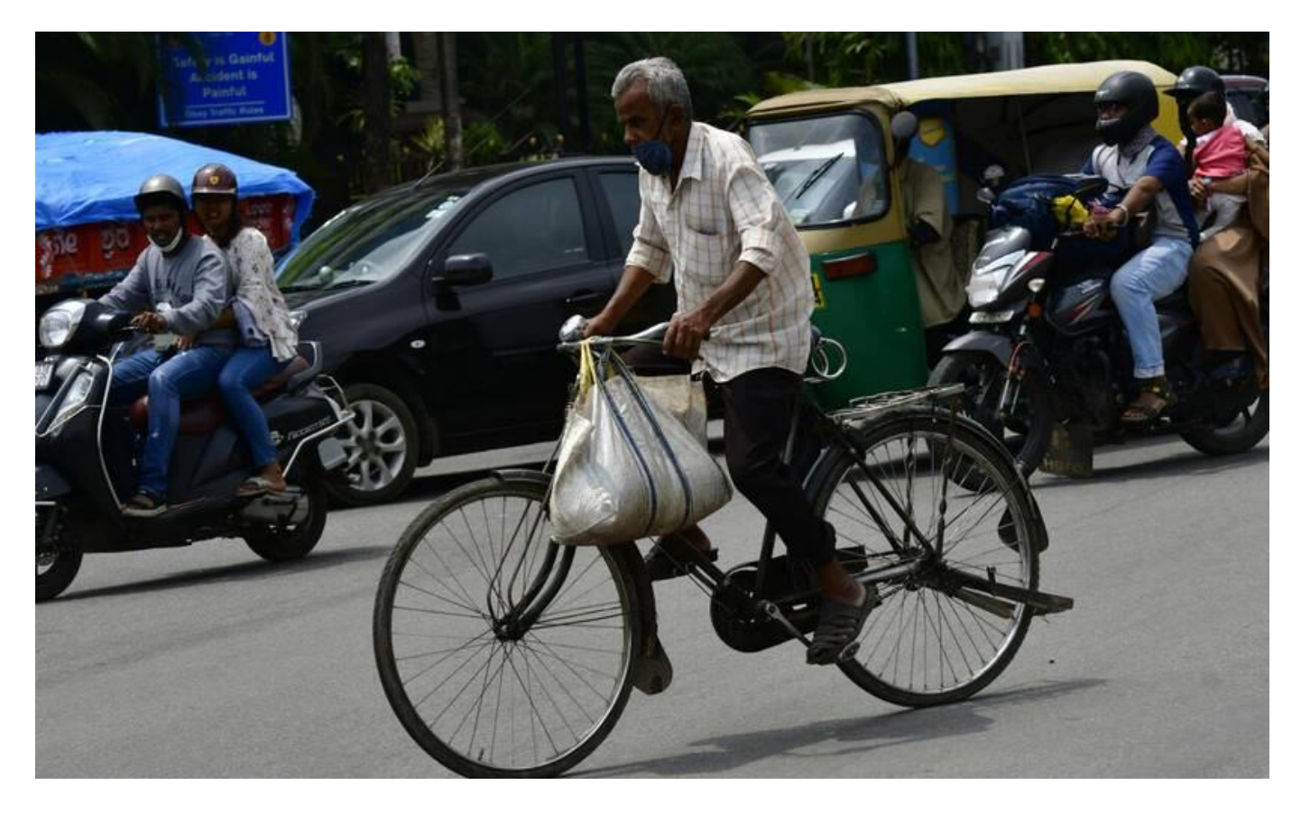
A cyclist navigates through traffic at a junction in Bengaluru on May 14, 2022.

In the new millennium, specific polices have been recommended for urban mobility. In 2006, the first National Urban Transport Policy (NUTP) was adopted by the Government of India<sup>26</sup>. Designing cities "for people, not for vehicles" made its debut in official thinking. The policy asked for a revision of several standards in order to achieve this vision. From 2014 onwards, the Smart Cities Mission led to the formation of Special Purpose Vehicles and appointment of CEOs for efficient implementation. Many cities have been designated "Smart Cities". The programme began with 100 cities, with completion dates for the projects set between 2019 and 2023. As of 2019, the effective cumulative completion rate of all projects was 11 per cent. As of March this year, 3,577 projects had been completed out of a total of 6,939 tendered projects, utilising Rs. 60,073 crore out of a total tendered cost of Rs. 1,91,294 crore.<sup>27</sup>