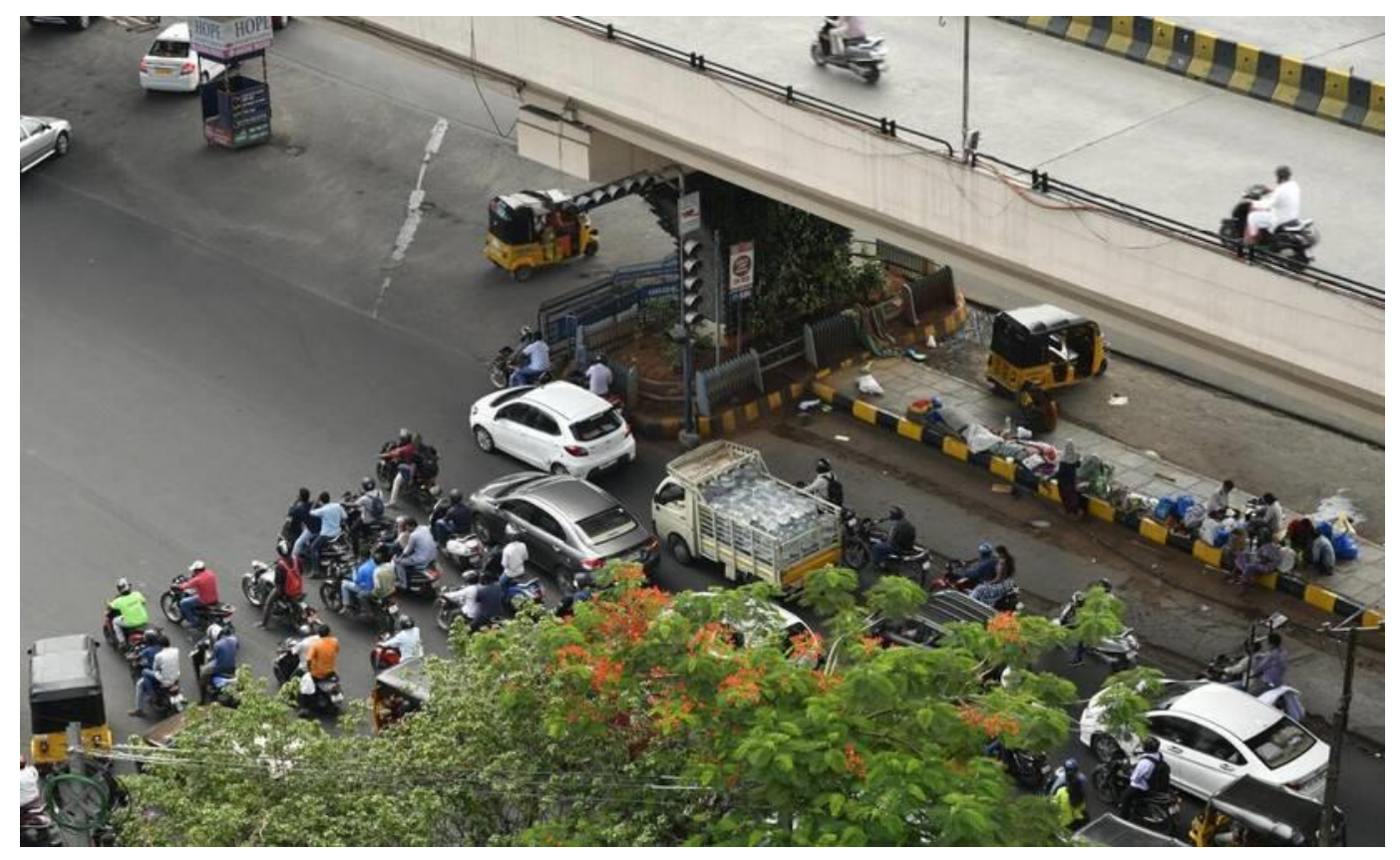
A poorly marked zebra crossing occupied by motorised vehicles makes it inaccessible for pedestrians at a busy intersection in Hyderabad.

Encouraging children and the elderly to walk as much as possible also provides individual benefits in the form of better health outcomes. The social benefits of such an approach include a reduction in the number of vehicular trips, resulting in a lowering of local and global emissions. For this change to take place, a fundamental flaw in the approach to road design - to cater to smooth flow of motorised traffic - needs to be corrected. In addition, there is a need for a long-term vision of accepting zero deaths of pedestrians in cities. This should be supplemented with a road map for achieving this target in the next decade.