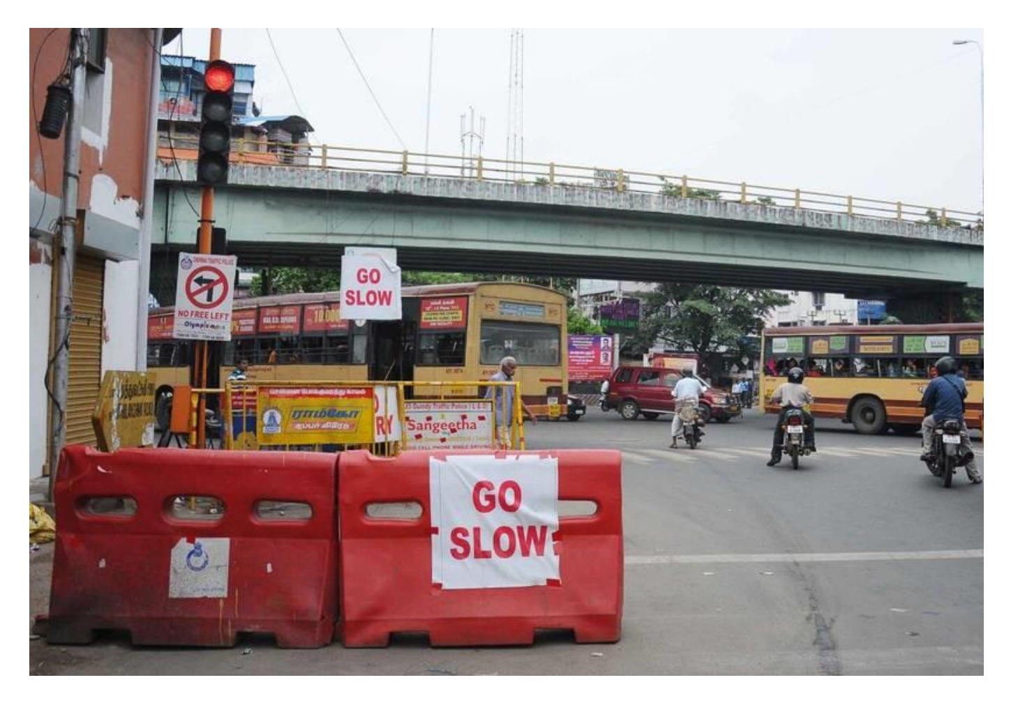
A No Free Left marking in Chennai.

In the last decade, many street design guidelines have become available to guide cityengineers. The Indian Roads Congress has revised the Urban Street Design Guidelines. Global best practices have been introduced by NGOs working in a few cities in India. However, city-engineers and planners often need city-specific guidelines. Preparation and implementation of city-specific guidelines require a combination of civil engineering and design skills of architects. Public works department and municipalities should induct designers and planners to work closely with civil engineers to make pedestrian-friendly streets. Compliance with current street design guidelines should be made mandatory by law. Traffic enforcement agencies also have to be guided to ensure pedestrian safety and compliance to pedestrian requirements over motorised traffic.