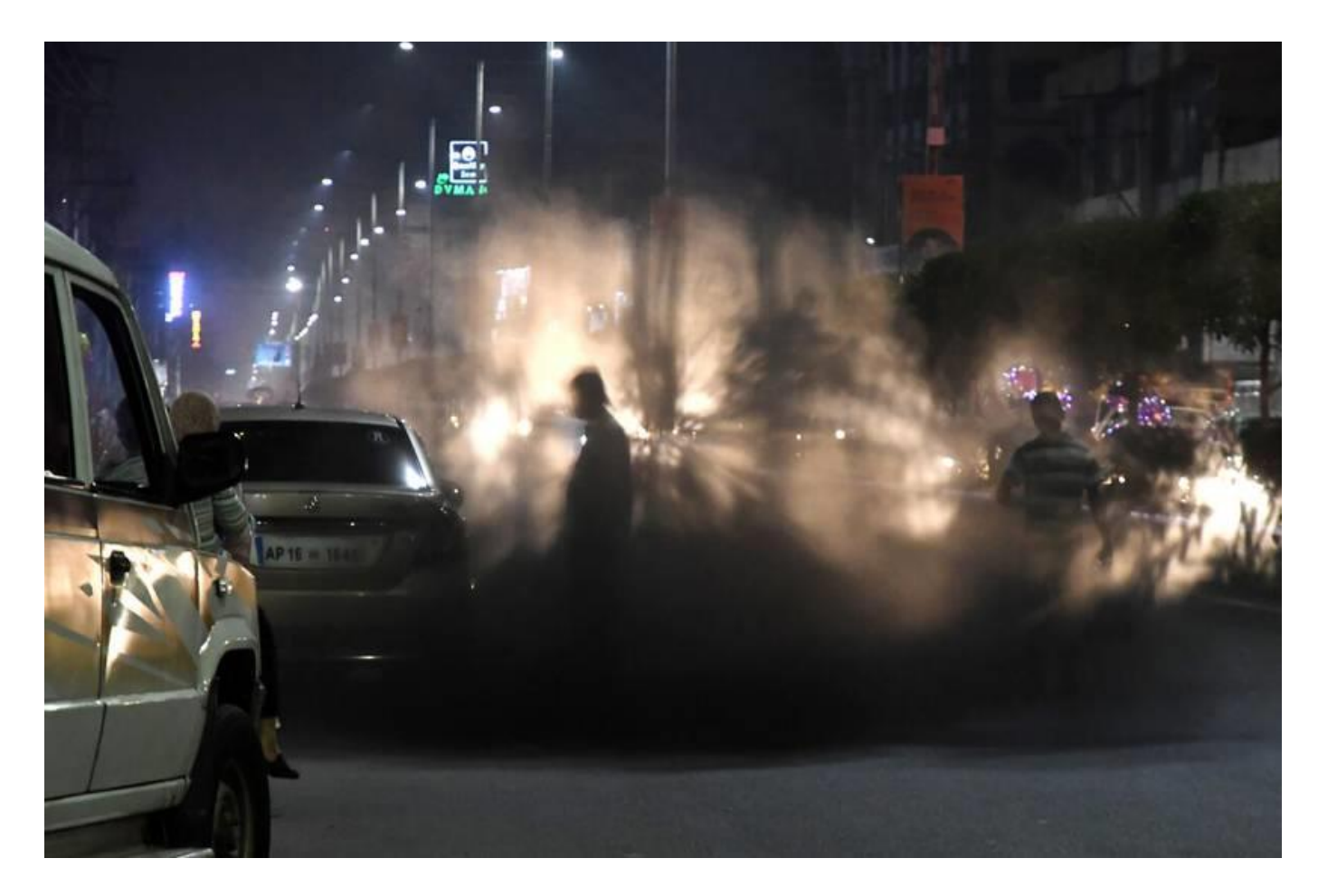
Thick smoke emanating from a car engulfs the surrounding areas including pedestrians in Vijayawada.

The benefits of increased walking include not only reductions in traffic congestion, air pollution and emissions, but also improvements in public and private health. (Doyle et al., 2006<sup>18</sup>, Durand et al., 2011)<sup>19</sup>. Woodcock et al studied different mobility scenarios in London and Delhi to assess the public health benefits and impact on carbon dioxide emission. The active transport scenario, which included improving infrastructure of walking, bicycling and public transport systems, not only reported substantial change in CO<sub>2</sub> emissions but also reduction in other adverse health outcomes. The largest health gains were from reductions in ischemic heart disease (11–25 per cent of total ischemic heart disease burden), cerebrovascular disease (11–25 per cent of total cerebrovascular disease burden), and diabetes (6–17 per cent of total diabetes disease burden); the reduction in road traffic injuries was 27 per cent. (Woodcock et al 2009)<sup>20</sup>